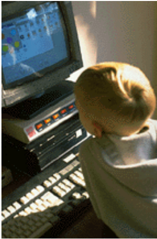
What do you think she wants to do? Trade Stock or Currency