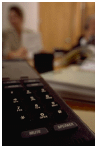
Involuntary philanthropy. IRS.gov Pub. 950 explains estate taxes. The top marginal tax rate for estates in 2009 is 45%.

What a great Christmas gift that would make!